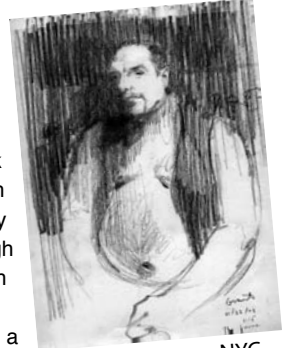
Me at The Lure, NYC