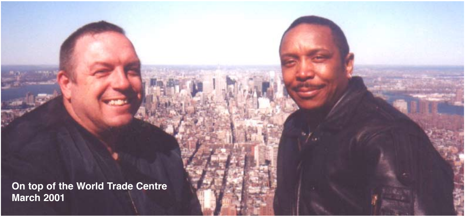
On top of the World Trade Centre March 2001