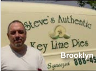
Brooklyn Squeezed 888-45