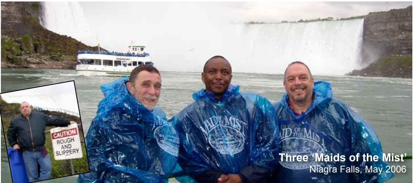
Three 'Maids of the Mist' Niagra Falls, May 2006