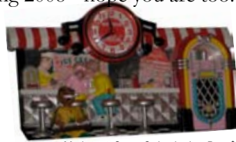
My latest Coca-Cola clock, eBay $20

Meanwhile, I'm looking forward to a more exciting 2008 - hope you are too!