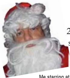
Me starring at Henry Fawcett school, Vauxhall

2007 has been a bit subdued, and completely overshadowed by the £13,000 bill from Southwark Council I received for double glazing, despite already having it installed. I won a tribunal ruling but still ended up having to pay, so could not afford much travel this year - and I missed The Black Party in NYC for the first time in 13 years! However it is all sorted now, so plans for next year include Las Vegas and Cape Town!