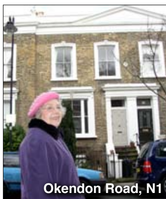
Okendon Road, N1