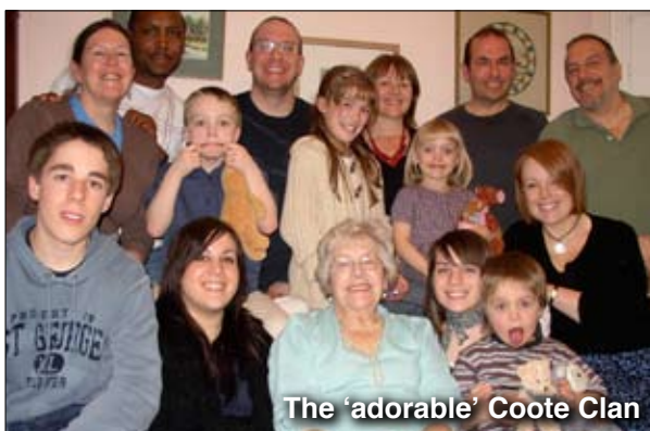
The 'adorable' Coote Clan