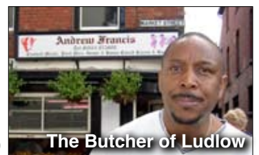
The Butcher of Ludlow