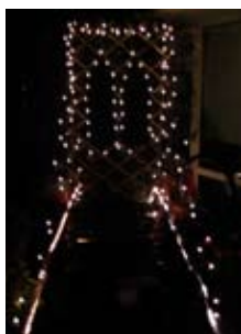
See the video at: www.stephencoote.co.uk/next.htm

2007 has been a bit subdued, and completely overshadowed by the £13,000 bill from Southwark Council I received for double glazing, despite already having it installed. I won a tribunal ruling but still ended up having to pay, so could not afford much travel this year - and I missed The Black Party in NYC for the first time in 13 years! However it is all sorted now, so plans for next year include Las Vegas and Cape Town!