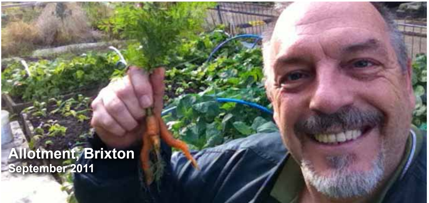
Allotment, Brixton September 2011