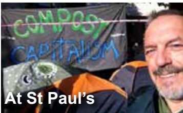
At St Paul's