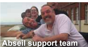
Abseil support team